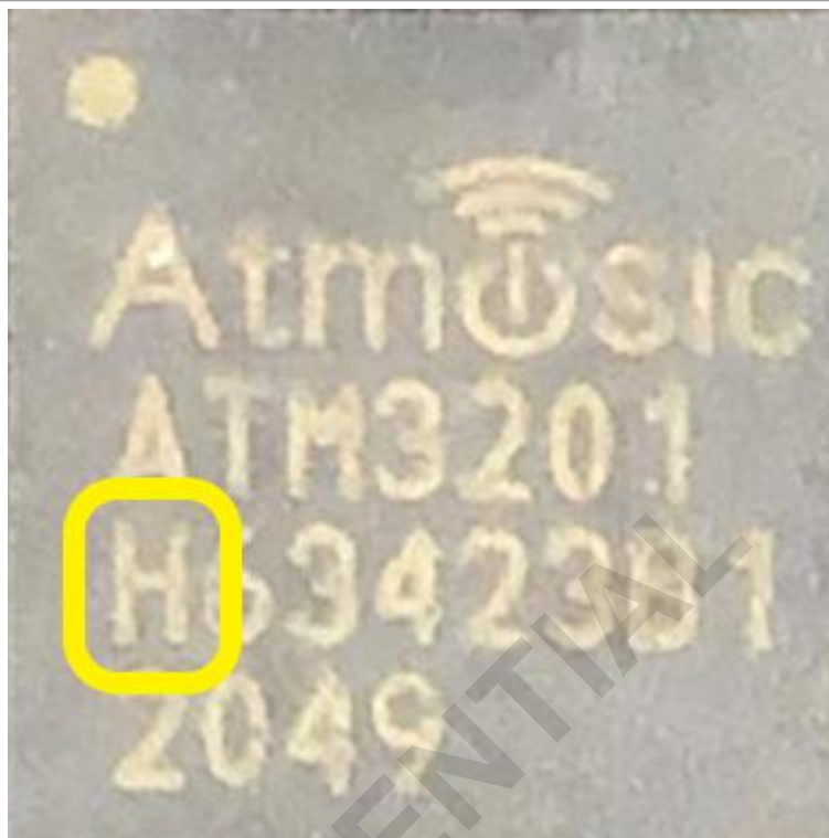
Figure 2 - Top Side Part Marking with First Character of Lot Code Highlighted

Table 1 maps the first character of the lot code to the appropriate part version.