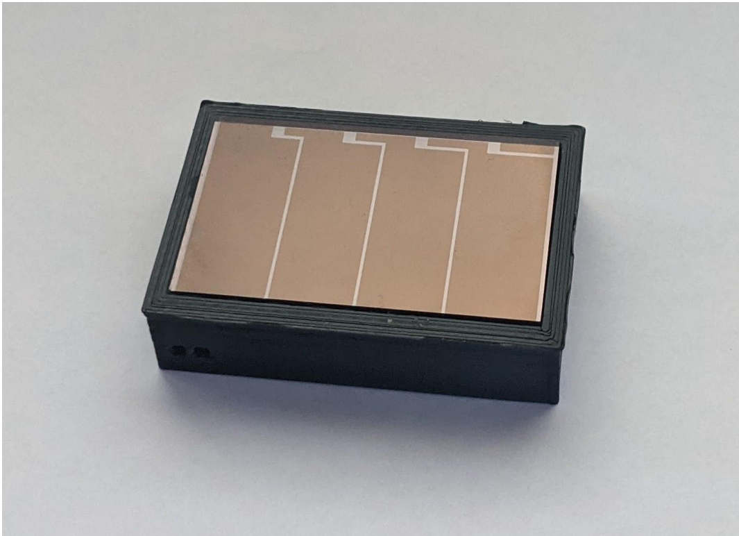
Figure 1 - PV Beacon Unit

The mini beacon's internals can be viewed by sliding off the rear cover of the unit. Figure 2 shows the exposed circuit board with the battery holder and supercapacitor. The Bluetooth LE module attached to the opposite side of the board is partially exposed at the top of the figure.