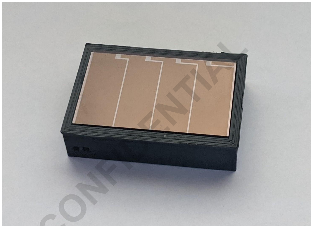
Figure 1 - PV Beacon Unit

The Atmosic PV beacon is shown in Figure 1 . The beacon incorporates a Panasonic AM-1454 Amorphous Silicon PV cell to harvest ambient light and a 33 mF supercapacitor for storage of any excess energy. An optional coin cell battery can be used to power the device when ambient light is unavailable and the supercapacitor is depleted. There is no rechargeable battery option for the beacon.